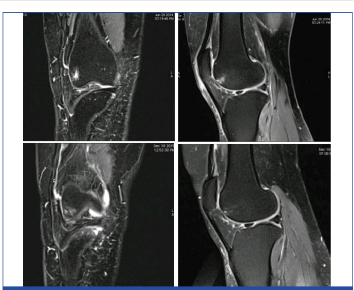
[Table/Fig-3]: Showing MRI of knee in coronal and sagittal views; before intraarticular PRP injection in the upper row and 18 months post PRP injection in the lower row showing a comparatively thickened articular cartilage.

which healed within a week by analgesics alone. WOMAC scores compared individually for pain, stiffness and physical function at 1^{\rm st} , 3^{\rm rd} and 9 months post PRP injection versus pre-injection [Table/ Fig-4] showed statistical significance with p-value less than 0.001 for almost all except for pain at 1^{\rm st} month (p=0.2408) as shown in the [Table/Fig-5].