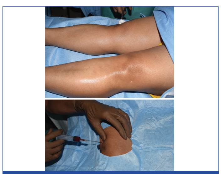
[Table/Fig-2]: Showing the autologous derived PRP being given intra-articular into the knee under sterile aseptic conditions.