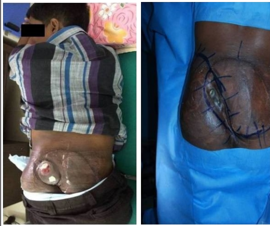
Figure 1: Clinical image of the tumor during the first visit before initiation of treatment.

decided to measure his QOL by means of the WHO and social functioning (SF)-6 questionnaire [16,17,18]. At times, modern medicine is concerned only with the eradication of disease and symptoms. However, in a field such as orthopedic oncology, the need for the introduction of a humanistic element into health care is useful, and hence, we decided to incorporate the patient's current assessment of QOL.