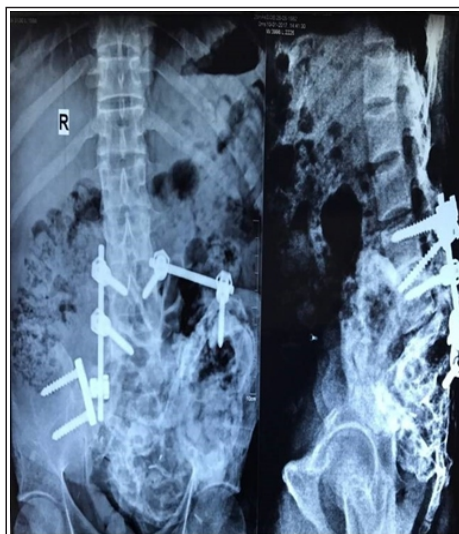
Figure 4: Current X-ray suggesting new bone formation involving the sacrum and ilium.

involving the sacrum and ileum and was decided to administer neoadjuvant denosumab. Loading of injection denosumab (120 mg) was given at 0, 8, and 15th day; it was later followed by 4 months of denosumab 120 mg being given subcutaneously. PET-CT was repeated at the end of 4 months (Fig. 3b) which suggested mild regression in the size of expansile osteolytic mass in the left hemipelvis, sacrum, and L5 vertebra. Subsequently, he underwent